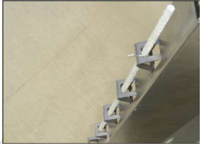
New SteelCrete III common stud and snap-in clip strip insert using rebar for additional reinforcing.