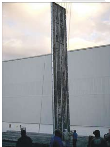
A 70' panel is lifted into place in Laredo, TX by a SteelCrete licensee.

A punched “tab” method was developed in 1999 where standard metal stud & track product was shipped to a shop where an expensive punch press stamped out these “L” or