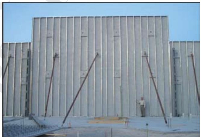
A 60'x55' SteelCrete wall panel erected in Laredo, TX.

Shortly after this, a major equipment manufacturer developed an energy-efficient metal stud design that results in framing with the energy efficiency of wood framing with web punch-outs that result in a "truss design" product that is stronger and lighter than conventional studs and usually allows a reduction in gage (metal thickness). This product is produced in the composite form as well as standard-type studs for all applications that utilize conventional studs.