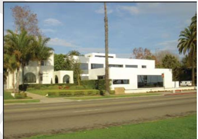
This 2008 newest concrete tilt-up house stands adjacent to the 1918 Raymond House, the oldest concrete tilt-up house and a national historical landmark by architect Irving Gill.

“J-Bolt” shaped 6" o.c. tabs which provided the embedment. Then the modified studs and track are shipped to the job site. Again, the tab spacing was incompatible with the wire mesh, so it also must be chaired up. This system’s inventor later learned a 50% strength increase resulting from the closer tab spacing and filed for a patent. A former partner designed a trailered